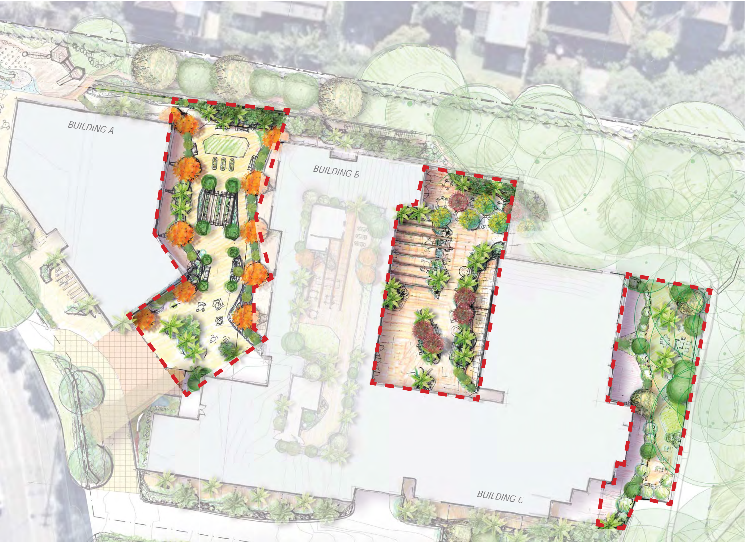
Not to scale