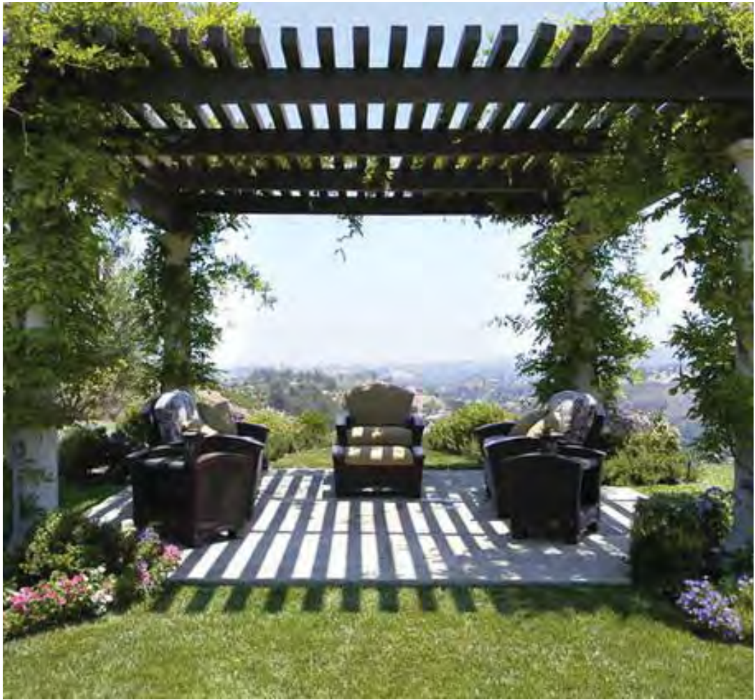
Pergola - shaded sitting area