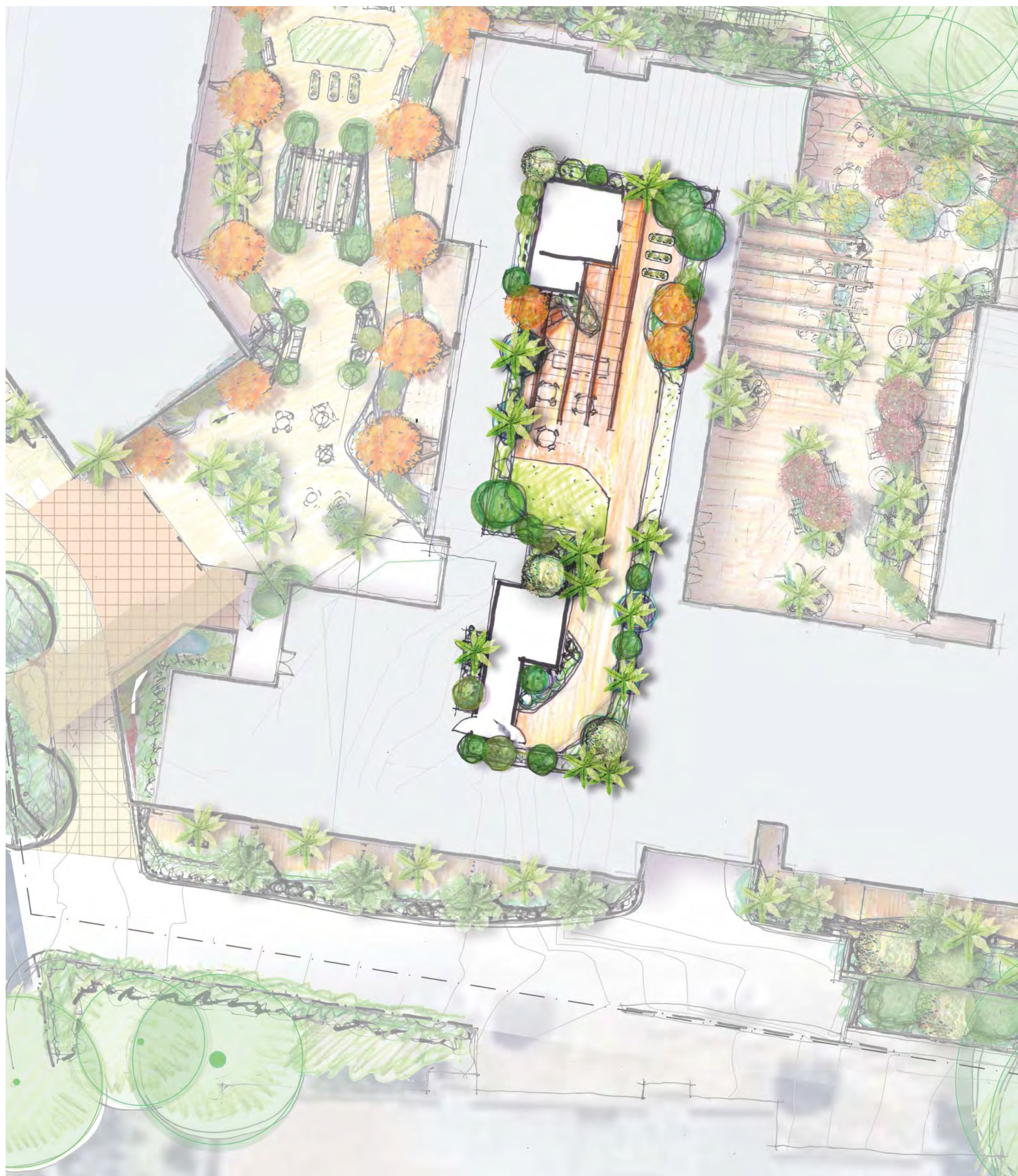
Not to scale