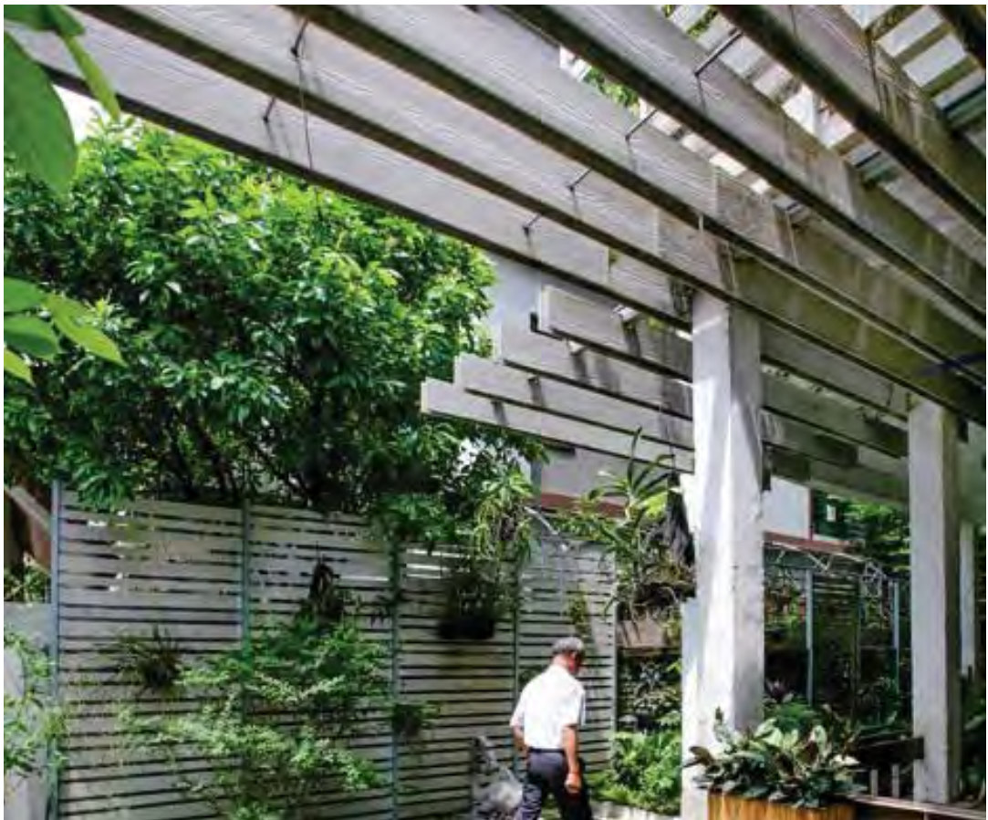
Pergola to undercroft + courtyard