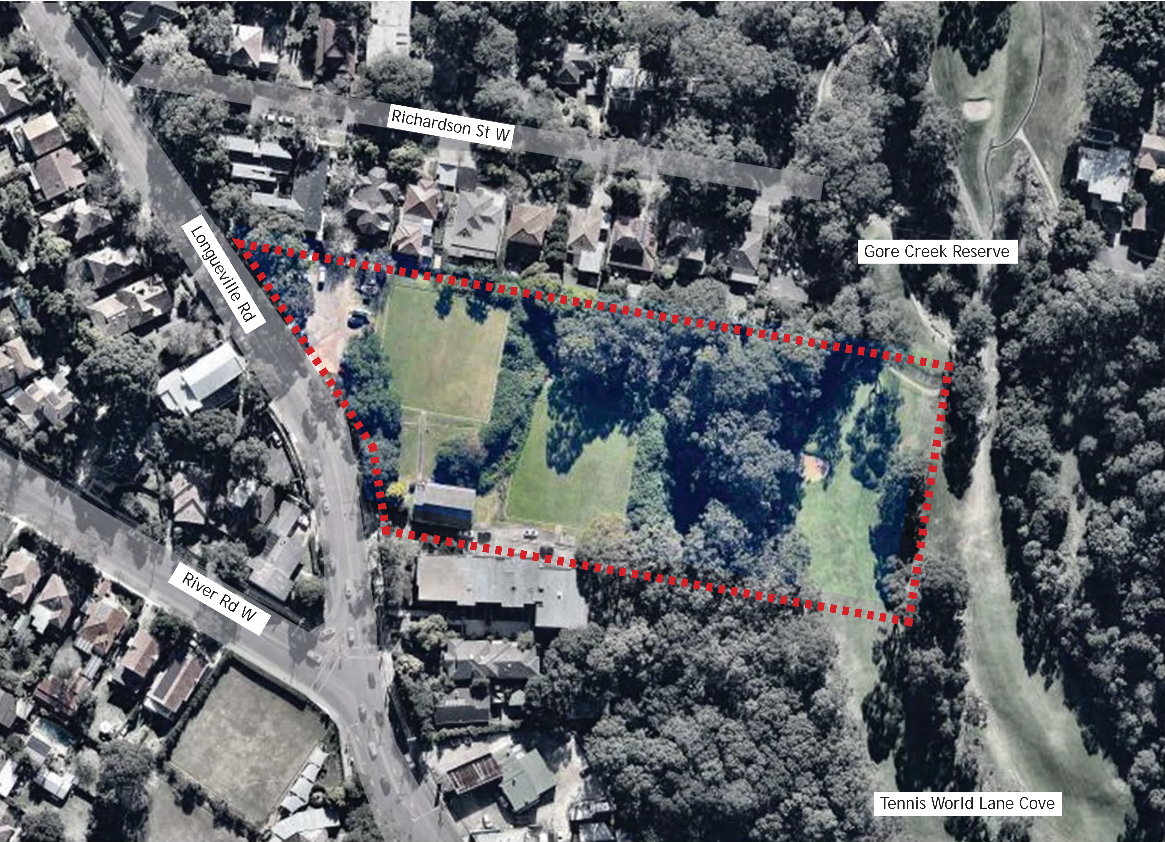
Not to scale