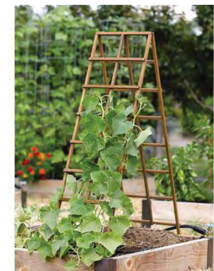
Resident+ Raised vege planters