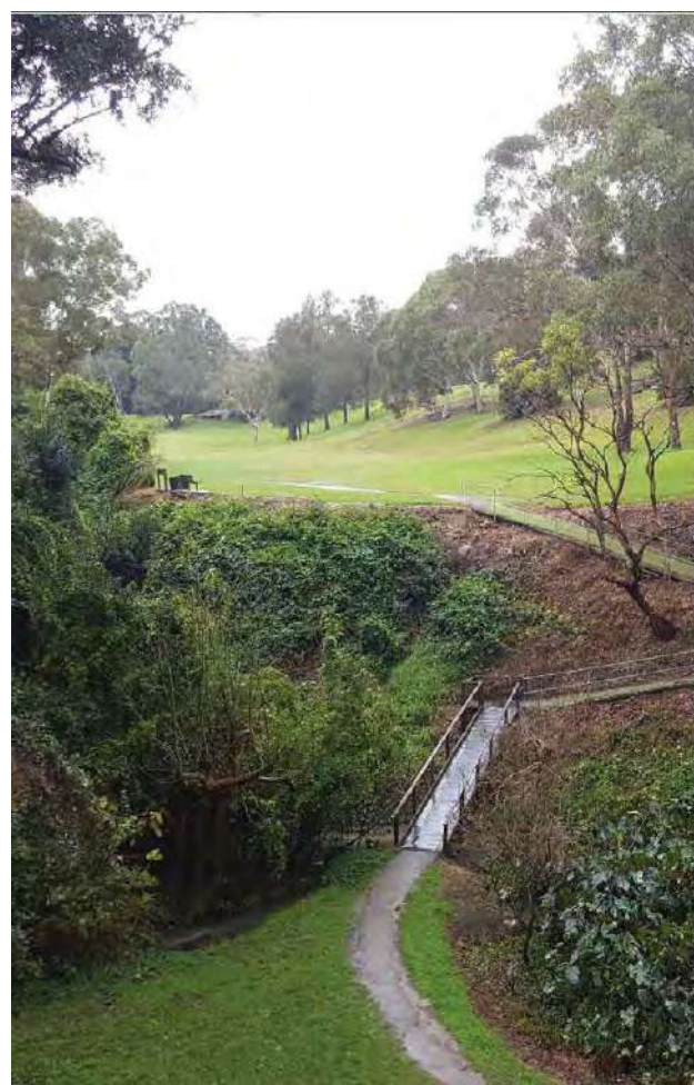
Bush land path