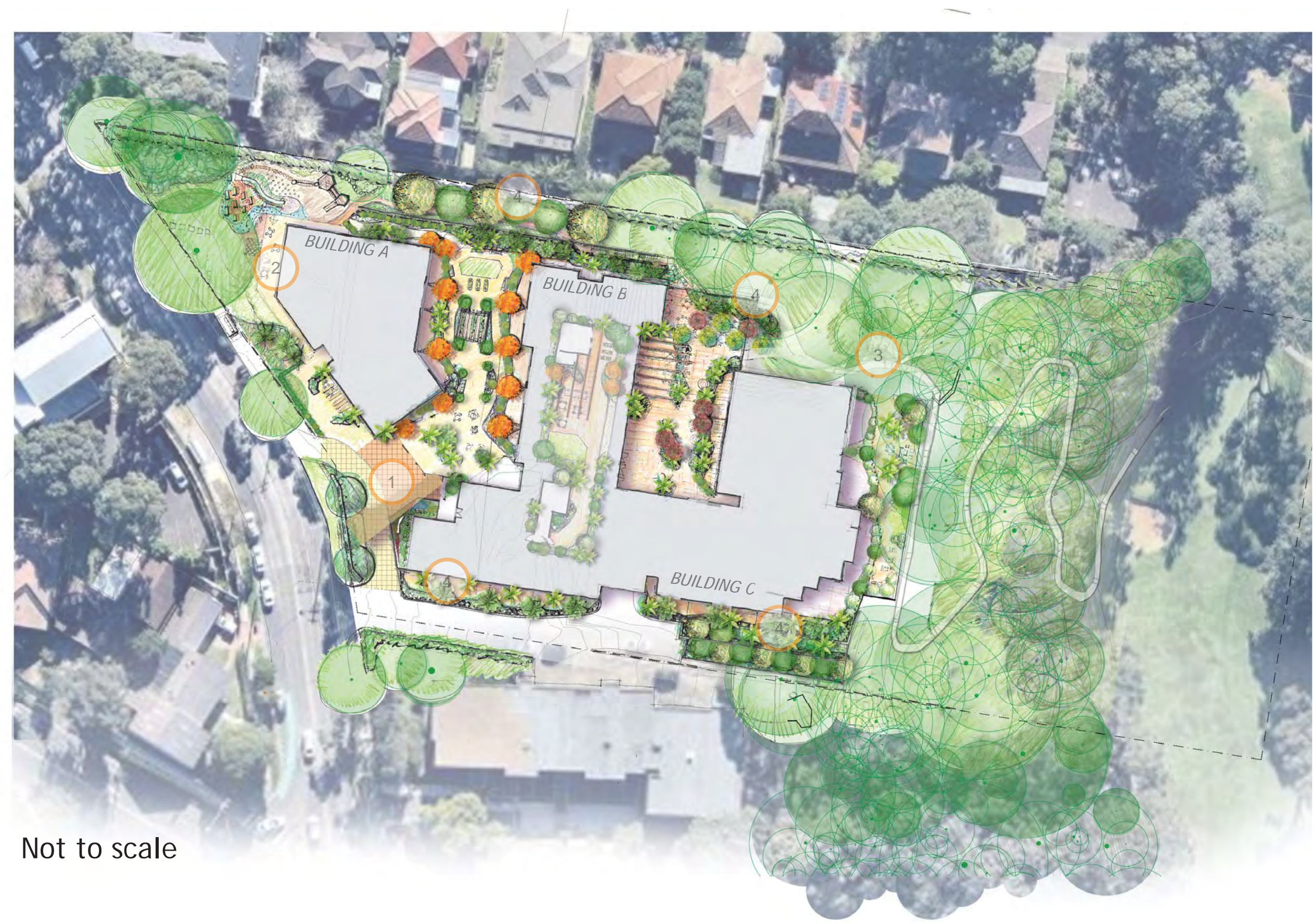
Not to scale