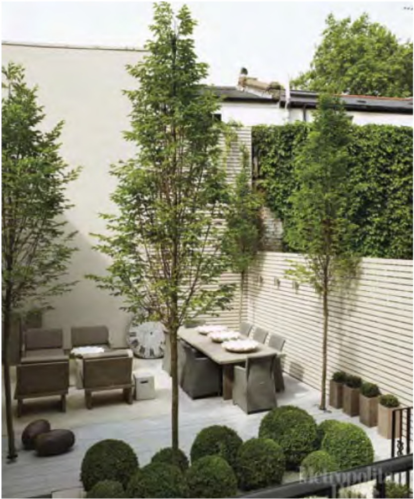
Outdoor dining in open area and under avenue of deciduous trees or palms