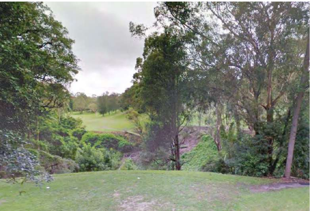
Adjacent Bush land characters