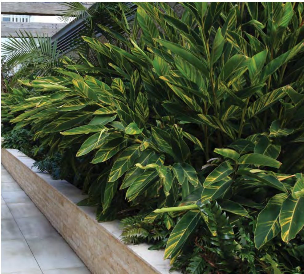
Raised planters with screening shrubs+ deciduous trees for summer shade+ winter solar access